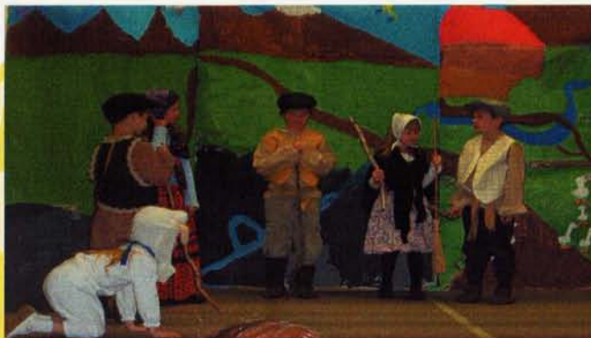
K-2 Class performing the play, "The Boy Who Cried Wolf".