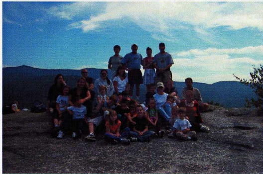
WVES School Hike Sept., 2004